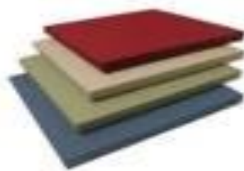
Enosh palet for sound

The company also makes the protocol of cooperation with the International Company for Optical in Egyptian Armed Forces to study, design and implementation of :